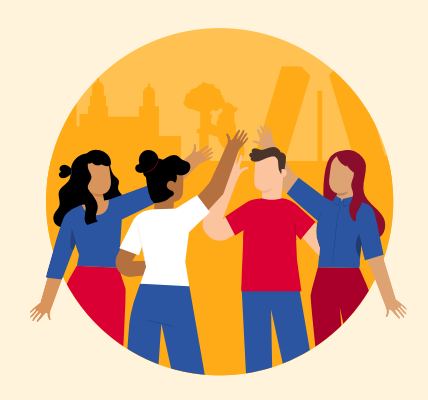
Settle in smoothly

Read more about the service by clicking here and let's get started!